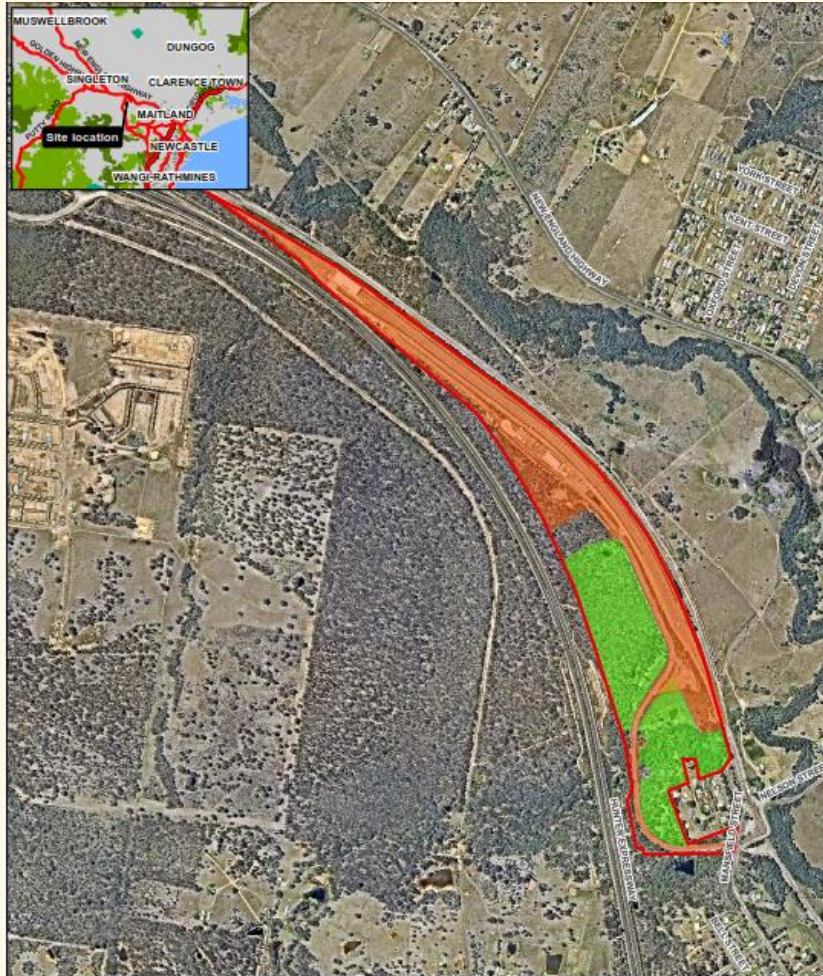
Figure 1: GTSF March 2017